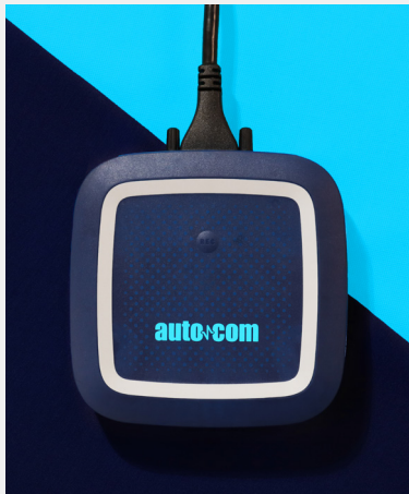
TITAN is compatible with both TRUCKS and TRAILER software.

Quick access to original Haldex Trailer Diagnostics and the original WABCO System Diagnostics in a single system. TRAILER software provide true multitasking for convenient and even more efficient diagnostics. The simultaneous display of various functions and items of information in up to four windows, makes diagnostics more transparent and saves valuable time